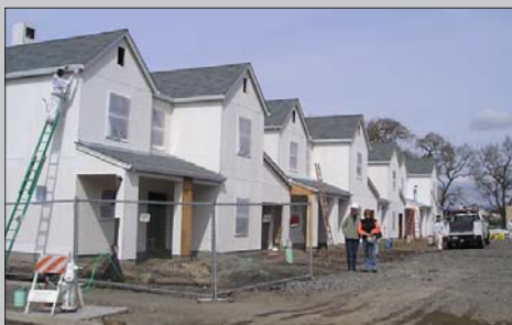
The children's houses are painted white and the grandparent triplex is red - reflecting the rich history of the property as a dairy ranch and family home.

We can hardly wait to see you at the Grand Opening, and to show you around the Village!