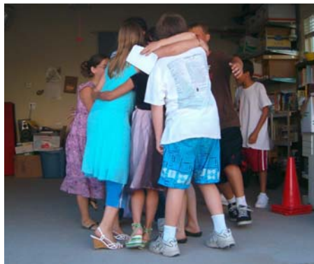
Group hug after the talent show.